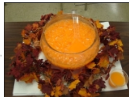
Lane's punch recipe looked absolutely scrumptious-- and it tasted great, too!