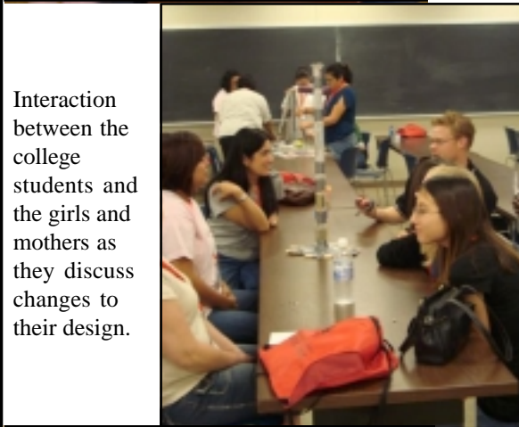
Interaction between the college students and the girls and mothers as they discuss changes to their design.