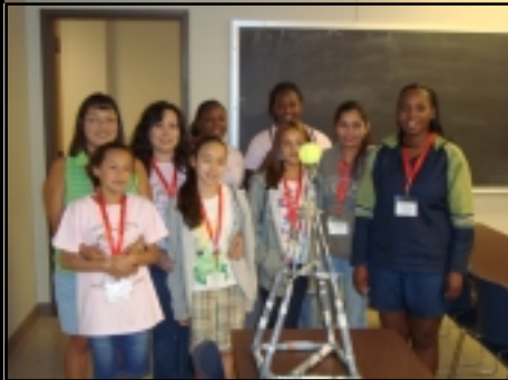
Each team posed for a picture with their creation after it was tested and approved.

joypenvann@suddenlink.net —3809 57 th Street