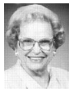
Past State President 1977-1979