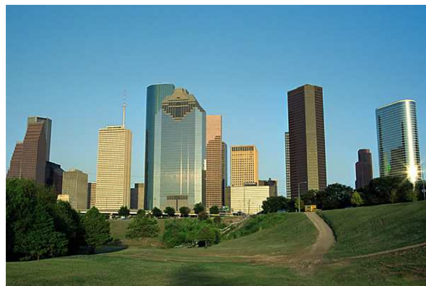
Welcome to Houston — Where green parks and skyscrapers are neighbors

AAUW Texas recognizes outstanding branches with the P.E.A.R.L. award.